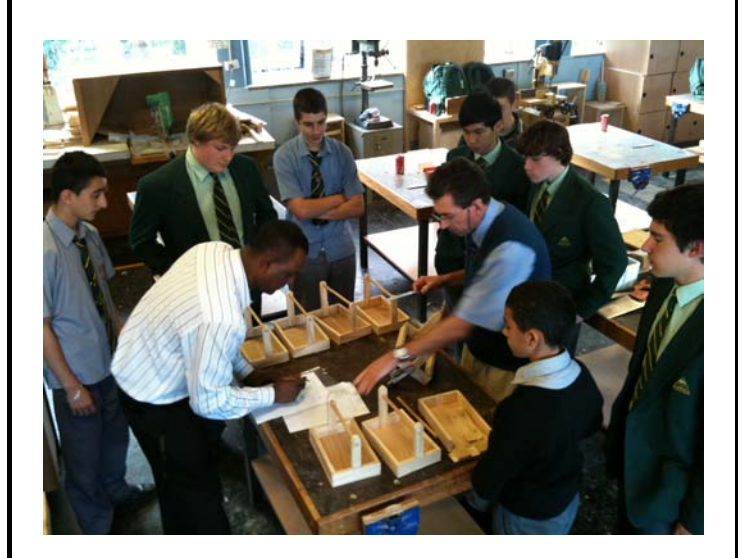
Working with Wood Challenge Students refurbishing front of school furniture

I would like to wish all members of the school community a safe and happy holiday.