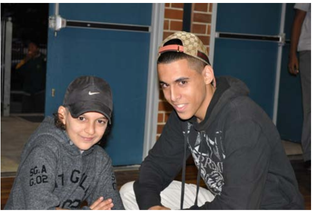
Rap Stars: Little Mo & Double T