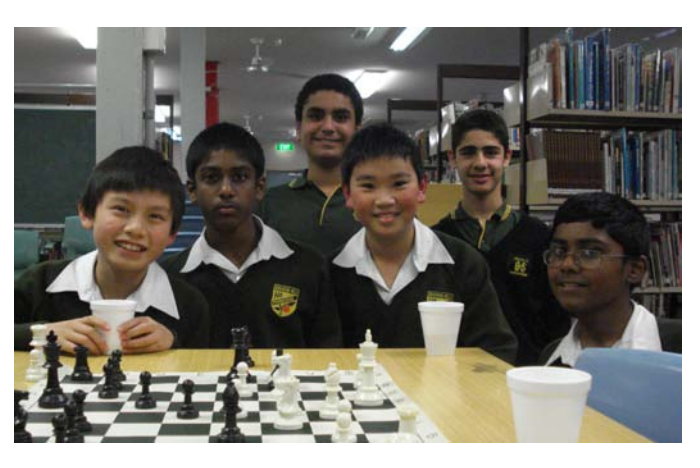
GBHS Vs Baulkham Hills HS