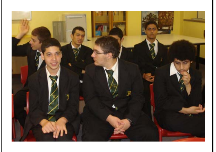
Year 11 Aspirations