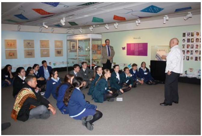
Youth Encounters Workshop

The Institute of Industrial Arts and Technology Education (IIATE) the professional body representing teachers of Industrial Arts in NSW, held a state-wide challenge for students undertaking Timber courses in year 9. Students had an opportunity to showcase their skill to 6 000 interested members of the public and potentially, future employers, at the Timber and Working with Wood Show, being held at Fox Studios, Moore Park.