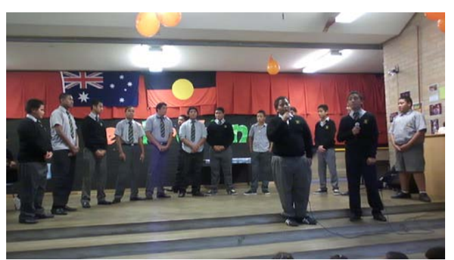
Harmony day held at Auburn North Primary 24/3/2011

Developing sound basic skills in students is very important in improving their Mathematical knowledge. Students face great challenges in processing Mathematical knowledge when their basic skills are not fully developed. This year, the Maths faculty has devoted a considerable amount of time planning and designing a "Building Basic Skills" project. This is a trial project and will be introduced to year 8 and 9 in week 4 of term 2. The purpose of this project is to develop basic mathematical skills in students. One Maths lesson per cycle will be allocated where students will work through a series of mathematical skills, and progress from one skill to another. The success of this project will determine if it can be offered to all students in years 7 to 10 next year.