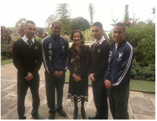
The School Leaders Conference