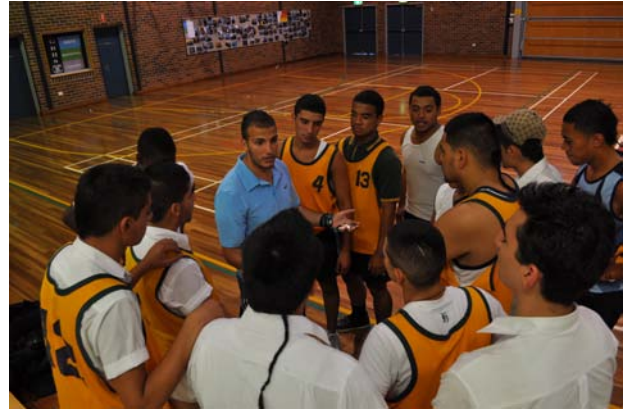
Basketball Gala Day