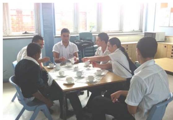
Year 11 Hospitality students enjoying Devonshire Tea

The introduction of Year 11 Hospitality is proving to be a popular choice amongst students. The class is developing a wide range of food and beverage skills. Students are preparing to participate in a Barista training course in order to gain essential coffee making skills. All Hospitality students will be expected to complete two 35 hours work placement for this course.