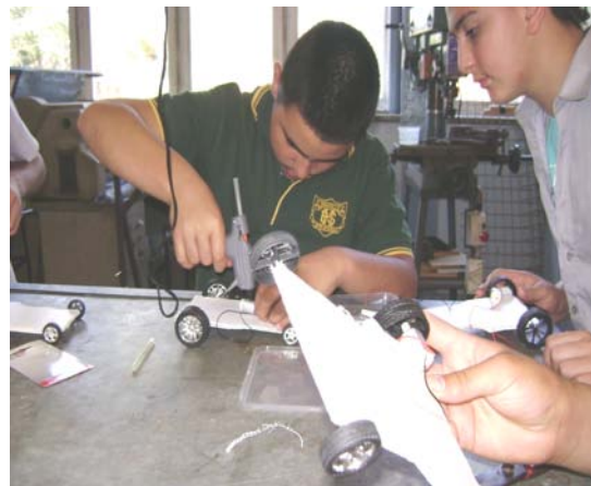
Year 9 Electronics class working on their Battery operated car