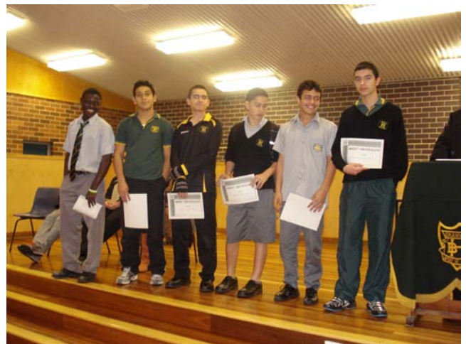
Students receiving DP Awards

certificates and Year Advisor awards. So many in fact that we will need to arrange another rewards excursion especially for year 7 students. We are intending to take the group of 60 to Fox studios to see Shrek 4 in 3D.