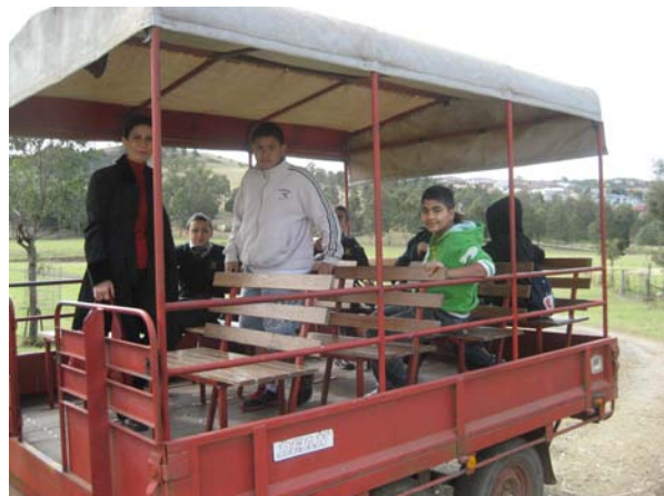
A Day at Fairfield Farm