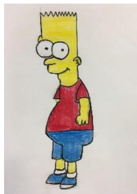
Bart Simpson by Yasir Taleb Yr 8

Year 7 and 8 Music students have been working on keyboard pieces with the school purchasing a beautiful electric piano of high quality for our gifted pianists. Year 7 were making music instruments and learning about instruments of the orchestra. Extension work incorporated ensemble performances with students rotating on drums and keyboard to perform as a group. Some exciting group work emerged from this activity and I am looking forward to the prospect of future ensembles from the talented boys in year 7.