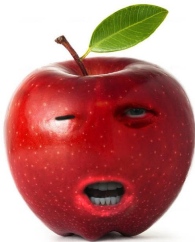
Jawad Ahmed's Trumpapple