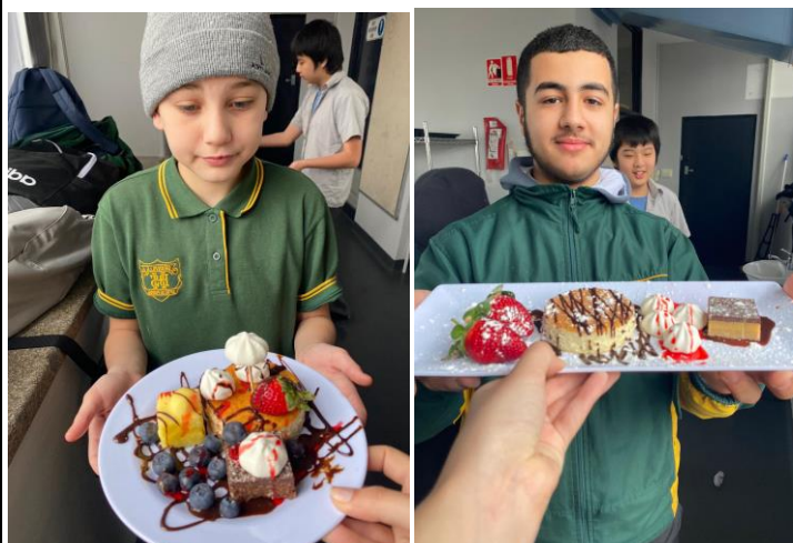
Year 9 students MasterChef students exploring and trialling food preparation and styling