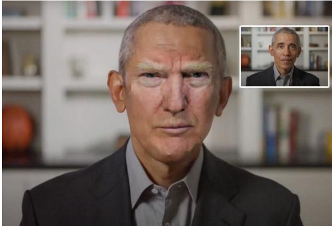
Mamoun Tayah's Troma: (Donald Trump and Obama)

Below are some works created by students in Multimedia 1